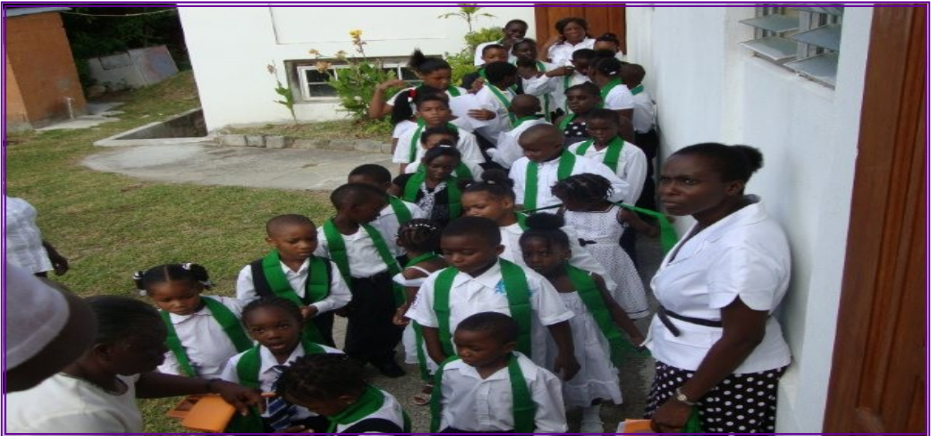
Bethesda SDA (Antigua)