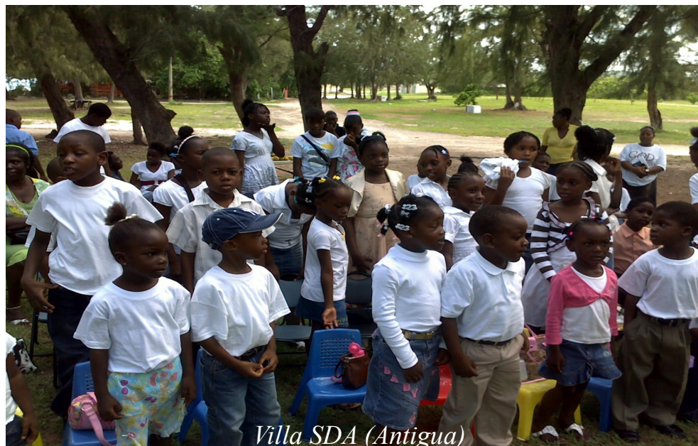
Villa SDA (Antigua)

enditnow is a global campaign to raise awareness and advocate for the end of violence against women and girls around the world. It aims to mobilize Adventists around the world and invites other community groups to join in to resolve this worldwide issue.