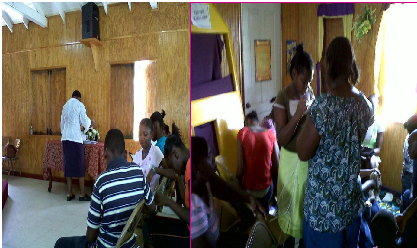
Scenes from New Maranatha VBS (Antigua)